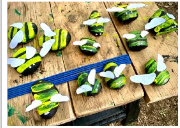
Making Bee Stones learning about pollinators.