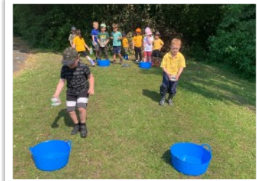
Water play was perfect on a hot summer's day!