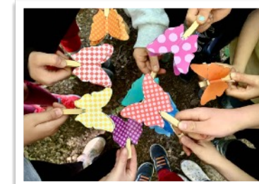
Insect week allowed us to explore clay insects and peg butterflies.