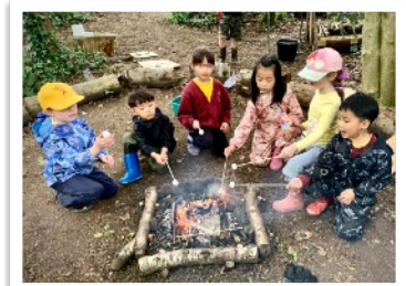
Fire safety, toasting marshmallows and expressing thankfulness.