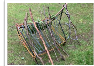
Always fun and games during free play.